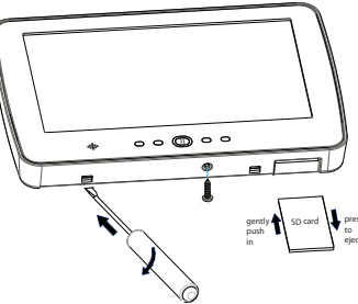
Figure 1 - Removing the backplate

4. Secure keypad backplate to wall using mounting holes. (See Figure 2.) Use all 4 screws provided unless mounting on a single gang box. Use the plastic anchors supplied if the unit is to be mounted on drywall. If using the keypad tamper, secure the tamper plate to the wall with a screw.